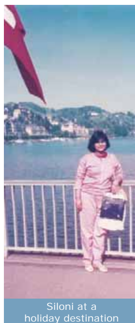
Siloni at a holiday destination