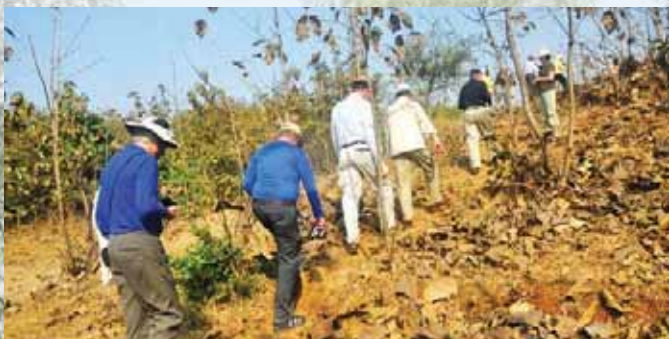
The group covered difficult terrain to see the entire project