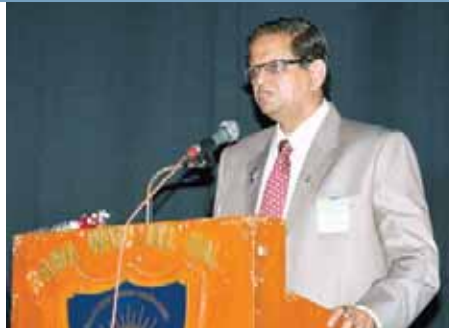
District Governor Dr. Bal Inamdar addressing the audience

Republic Day was celebrated with the distribution of R10.80 lacs as scholarships of R1,625 each to 665 underprivileged and mentally challenged students of 35 municipal and special needs schools, at the KC College Hall, Churchgate, at a glittering function.