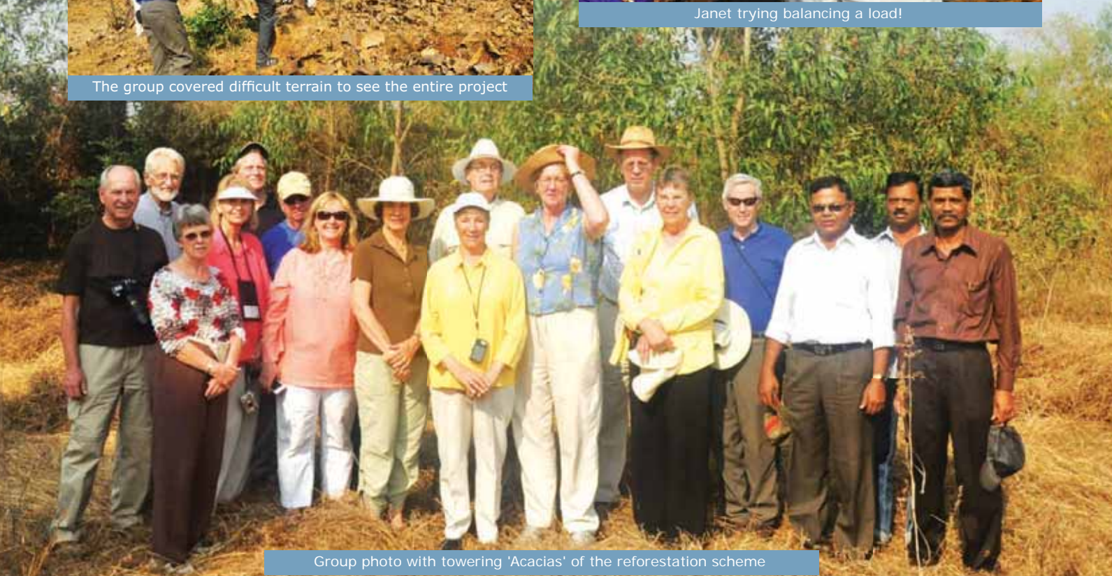
Group photo with towering 'Acacias' of the reforestation scheme