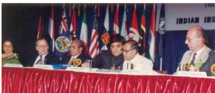
The 8 th IFPM World Congress in Mumbai, inaugurated by Mr. Pranab Mukherjee