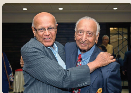
Receiver of Life Time Achievement Award function, given by Rotary Club of Bombay Mid-Town in 2024.