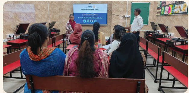
E-learning in BMC Schools