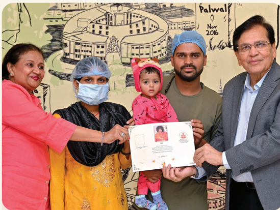
Little Hearts Surgery