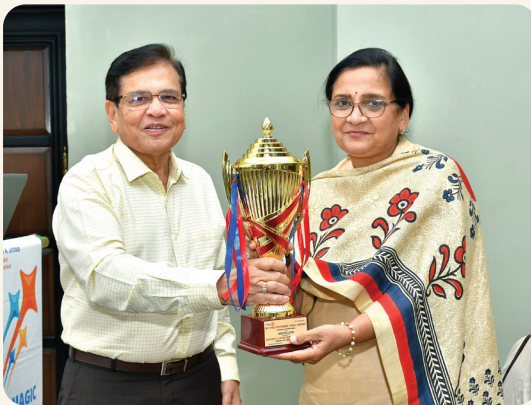
B2 : Jyontindra Vakil Trophy for Best Club Bulletins published.

Incredible District Trophies & Awards Event was held at Lonavala for recognizing the work of 108 clubs in District 3141.