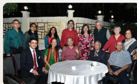
Till the last year of life, he was an active Rotarian including Mid-Town Fellowship meeting in 2024.