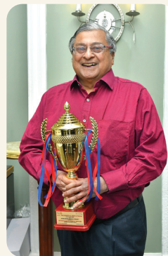
C10: Shantilal Mehta Trophy for outstanding Medical Project ("Little Hearts") for the year.