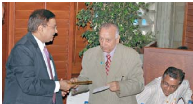
A memento to guest speaker