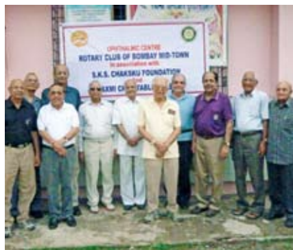
Outside the Ophthalmic Centre