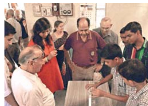
DG inspecting 'Introduction to Basic Technology' students

is conducted by a specialist agency but is free of cost for the students. On completion, they begin earning about ₹7,000- ₹8,000 per month in restaurants, hotels, malls etc. within reach of their village homes.