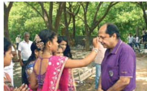
DG Vijay being welcomed to the school