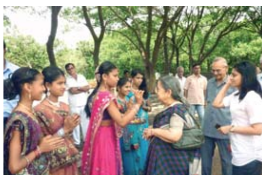
Welcoming ceremony at the School