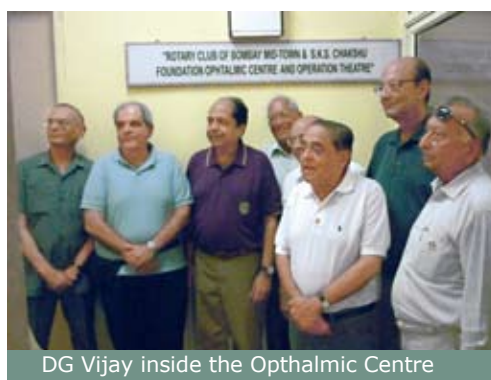
DG Vijay inside the Ophthalmic Centre